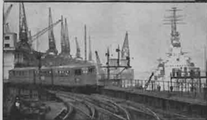
VIEWS AS SEEN FROM OVERHEAD RAILWAY